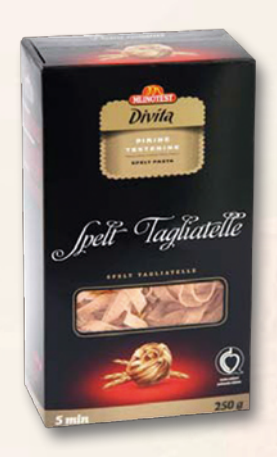
Divita Spelt Tagliatelle 250 g Cooking time: 5 min

Divita Spelt Penne Rigate 500 g Cooking time: 9 min