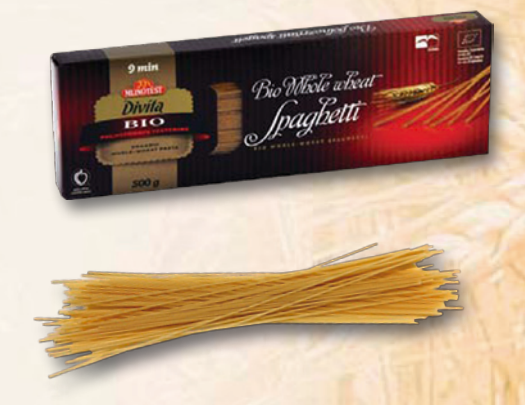
Divita Bio Whole Wheat Spaghetti 500 g Cooking time: 9 min